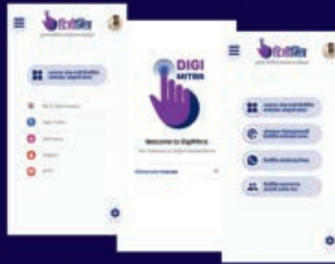
An app for non-tech savvy people to understand and learn app flows of other apps