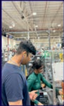
Internship opportunity at Mattel, Mexico