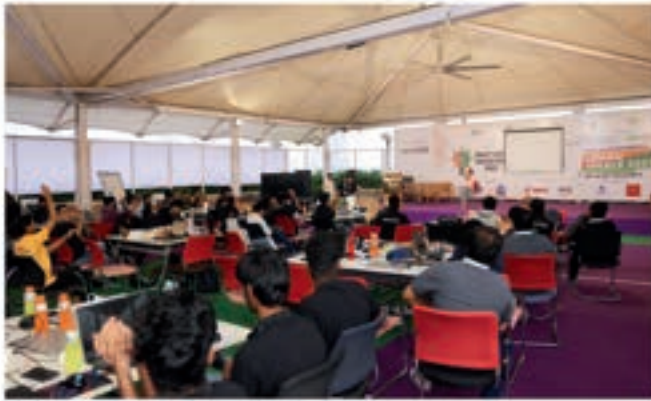
SIH 2024 Hosted at WeSchool