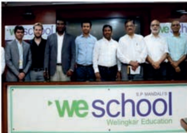
UMO Global Innovation - 2020