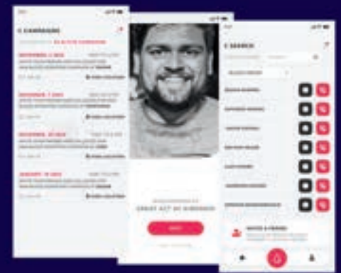
An app to reduce loss of life due to lack of information of blood availability