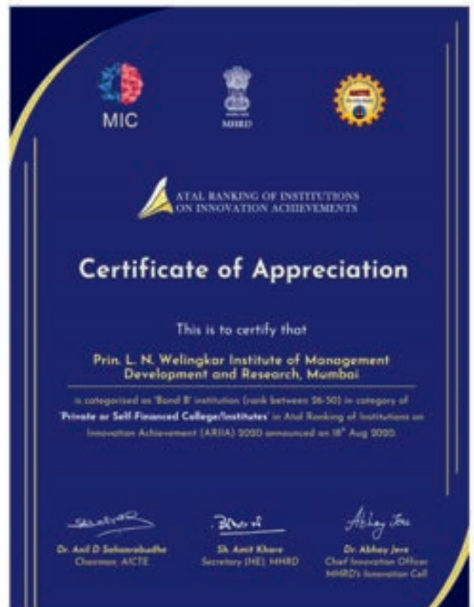
ARIIA - Atal Ranking of Institutions on Innovation Achievements - WeSchool has been ranked as one of the Top 50 Private and Self-Funded Institutions all over India.