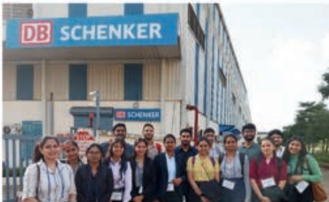
Industrial Visit to DB Schenker