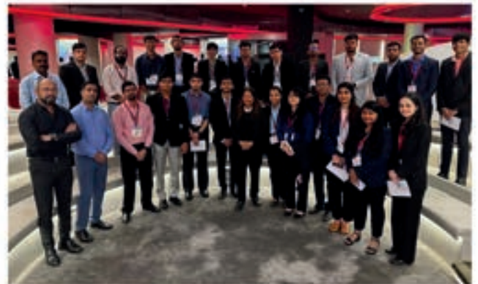
Industrial Visit to Mahindra Museum