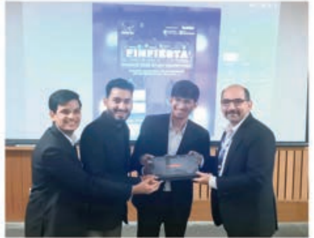
Winners of FinFiesta Finance Case Study Competition