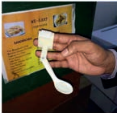
Spoon that assists persons with severe arthritis in having their meals