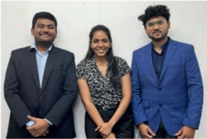
Secured second place at Apple-O-Nomics by IIM Sirmaur