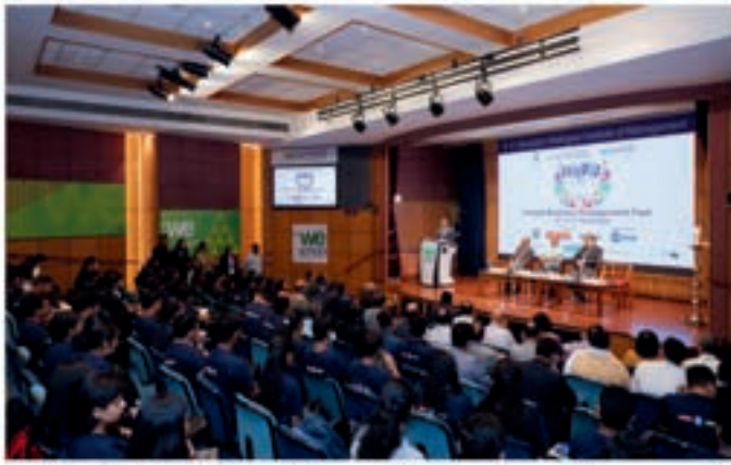
WeBiz 2024 - WeSchool's Annual National Level Management Fest