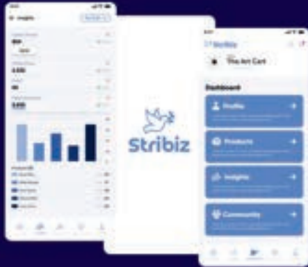
An app for women to host and manage their home grown businesses