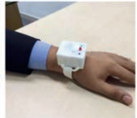
Wrist band for the hearing impaired for notifications