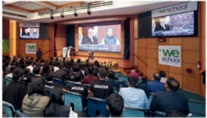
Interaction with Hon'ble PM Narendra Modi in SIH 2024