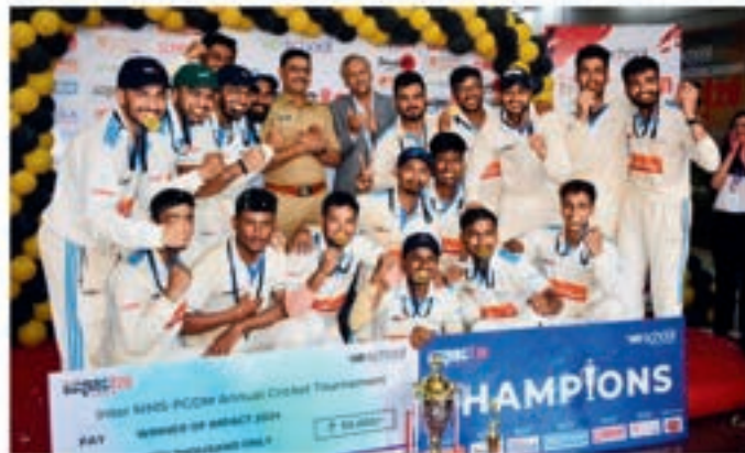
Impact 2024 - WeSchool's Annual Inter-college Cricket Fest