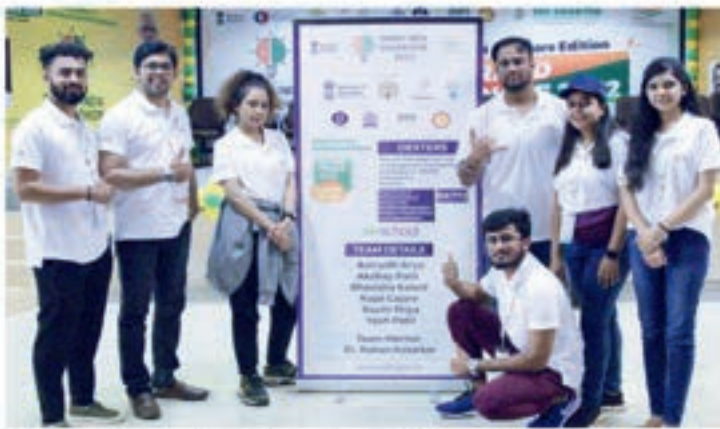
Winners of Smart India Hackathon 2022 for problem statement given by Department of Empowerment of Persons with Disabilities (Divyangjan), Ministry of Social Justice and Empowerment.