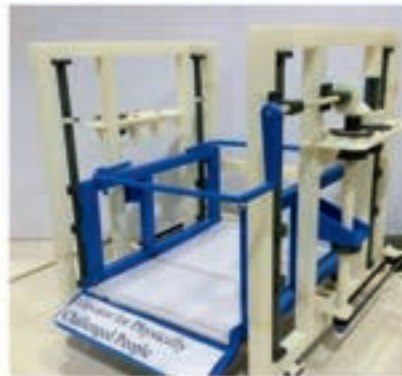
Vertical mobility for physically challenged persons