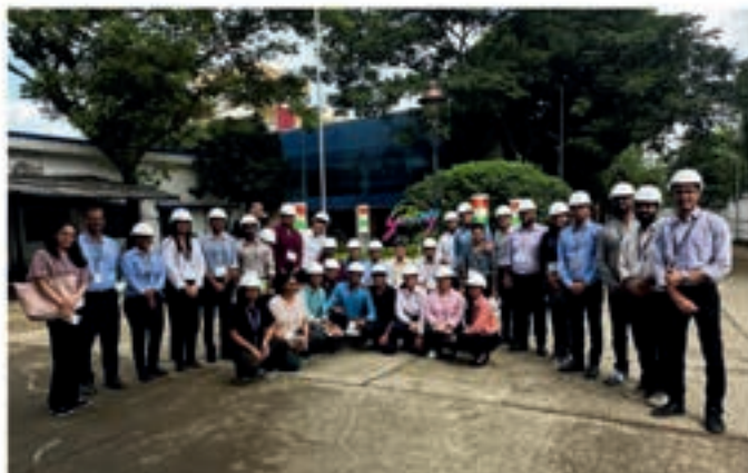
Industrial Visit to Godrej Chemicals