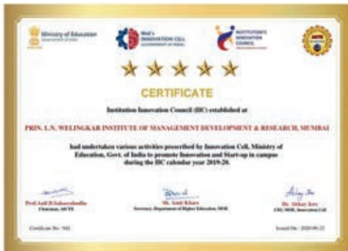
Awarded Highest rating at the Annual Performance Rating of Institutions' Innovation Council (IIC) in Higher Educational Institutes (HEI)