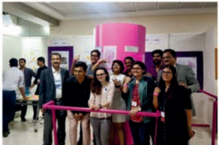
WeSchool - MIT India Initiative - January 2020