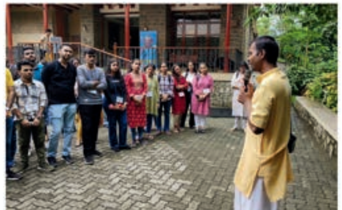
Industrial Visit to Govardhan Eco Village